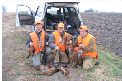
Iowa Pheasant Hunt 2006